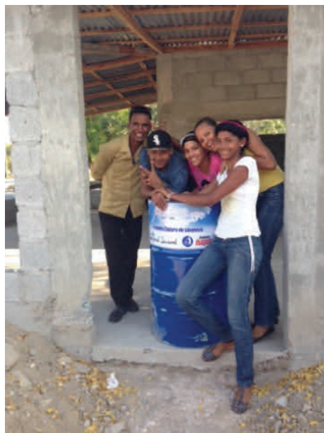
Youth group participants preparing for delivery of a garbage bin