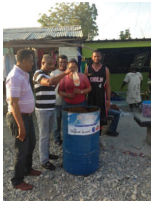
The mayor of El Ganadero and the citizens who will watch over the garbage container.