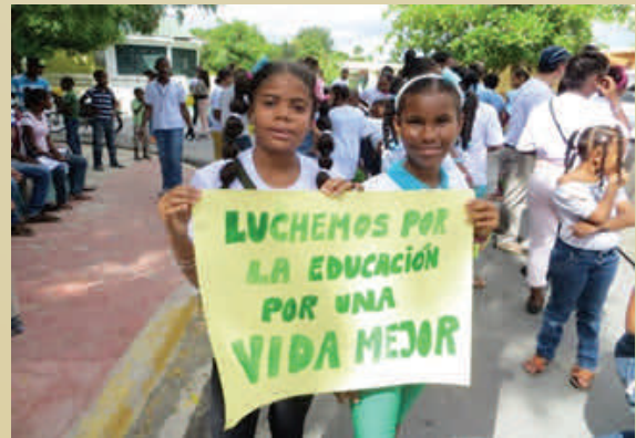
We Fight for Education for a Better Life.

WANT MORE INFORMATION ABOUT WMM OR LA SAGRADA FAMILIA?