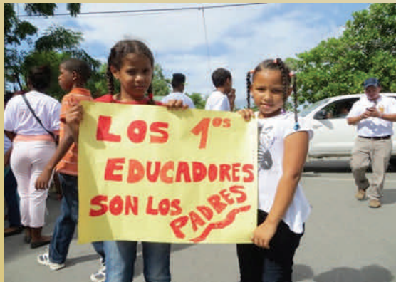
Our First Educators are our Parents.

Photos from last year's walk in La Sagrada Familia.